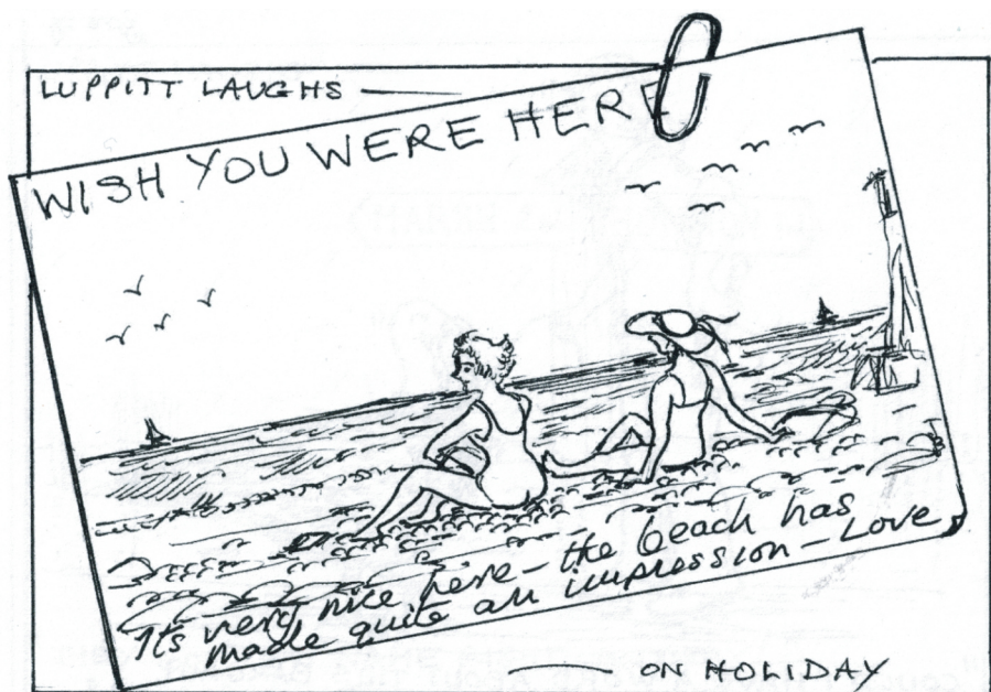
LUPPITT HARBOUR ON A GOOD DAY